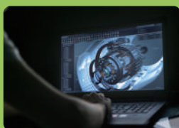
Professional graphics users