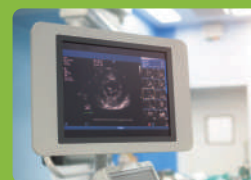
Embedded industrial applications